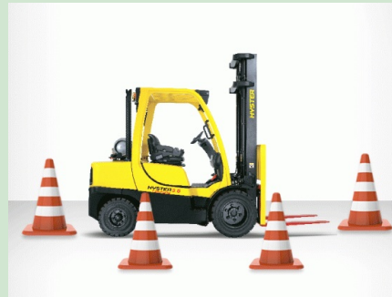
Forklift Training Oct 17 OR Nov 22 8:30AM-11:30AM Details here